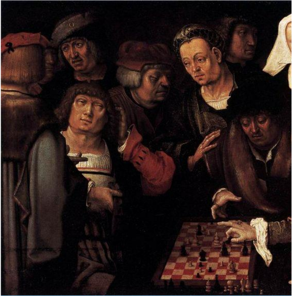
Lucas van Leyden. The game of chess. 1508