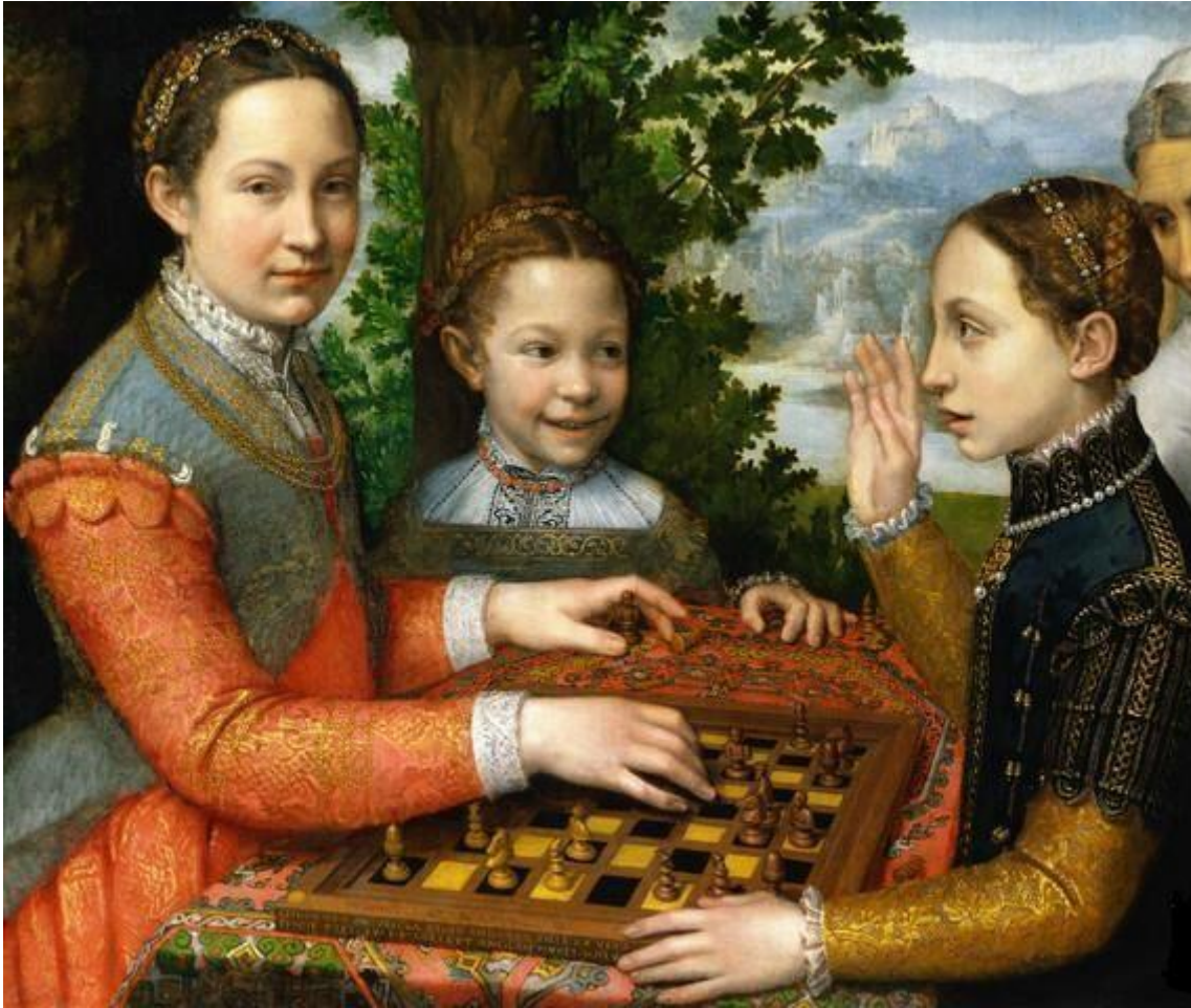
Playing chess. 1550. Sofonisba Guisassola