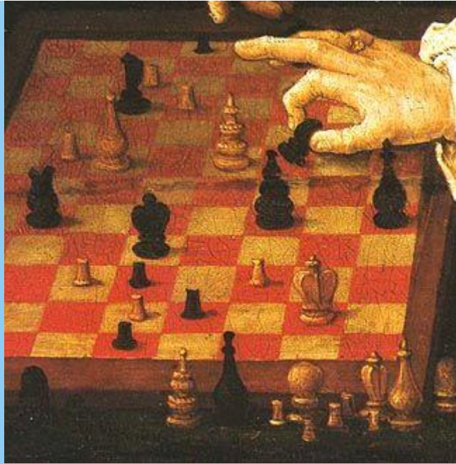
Lucas van Leyden. The chess match. 1508