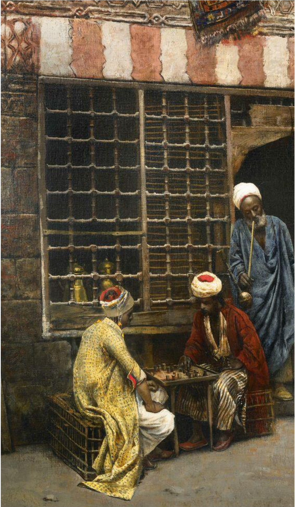
Edwin Lord Weeks. A game of chess in Cairo street. 1879